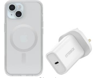
Clear* Type G Plug – White 78-81430 840304774609